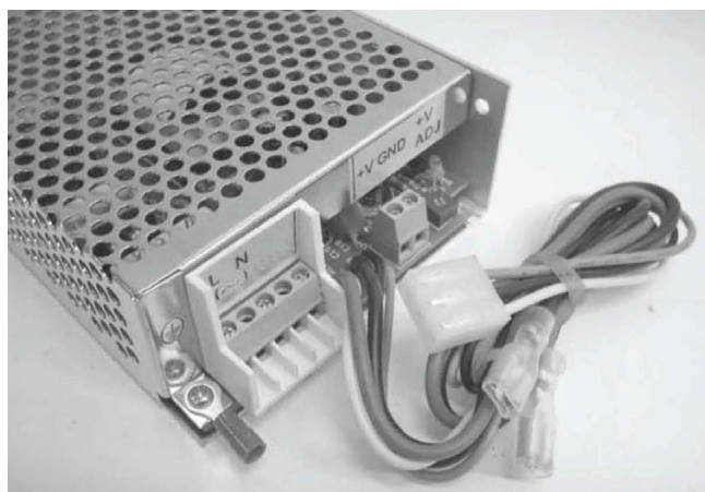
Fig. 1 connections