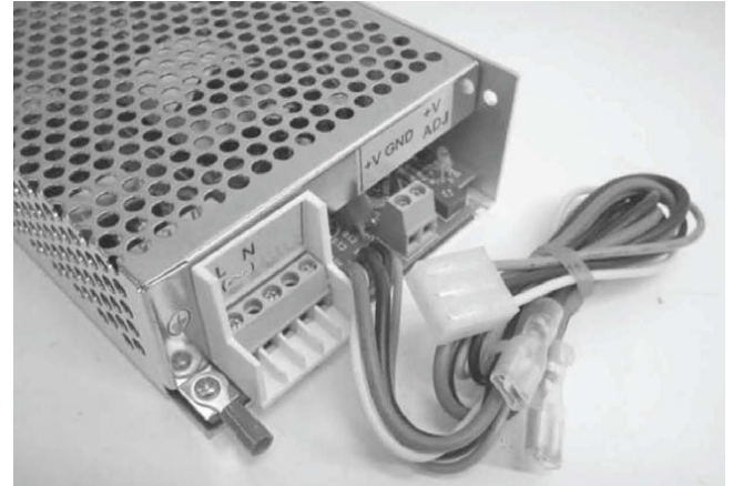
Fig. 1 connections